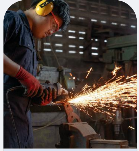
India holds huge Resource potential. Haven't explored even 20%.