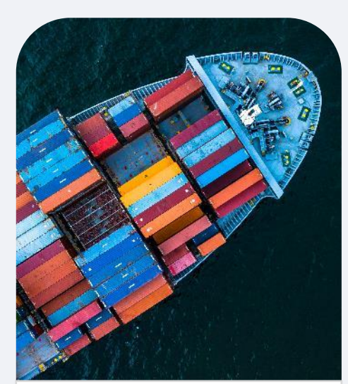
Uniquely diversified company across the resource spectrum