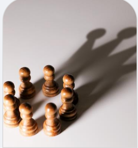
Demerger will createpure play companiesunlocking true valueof all our businesses