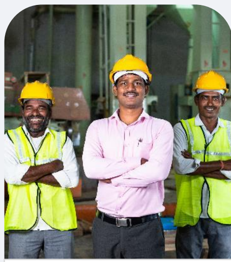
Vedanta as Indian Institution – will get to different level in next 25 years